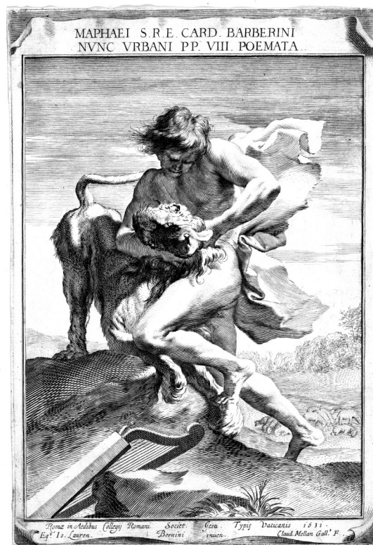
David wrestling a lion